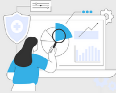
Master of Health, Economics, Management and Policy